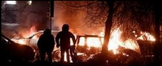
Rinkeby, Stockholm Sweden